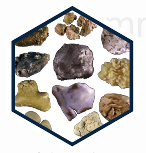
(Calcium Oxalate Monohydrate-Whewellite) (Calcium Oxalate Dihydrate-Weddellite)

The chemical composition of stones depends on the chemical imbalance in the urine. The five most common types of stones are: