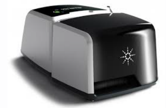
Cary 630 FTIR instrument screens for more than 1668 transmission spectra of human kidney stones and related chemicals using NICODOM kidney stones Analysis software