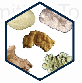
Calcium Phosphate Apatite